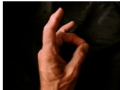
Figure 2b. Alpha Finger Pattern (Thumb-Middle Fingertips Contact)