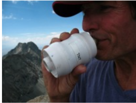
Figures 5 & 6. Structured Breathing during travel through difficult alpine terrain

During the long climbs, a “structured energy halo” was employed with a wetted cloth of structured water placed over the whole head and brain. It felt surprisingly good and much structured thought ensued through its wearing! (Figures 7 & 8.)