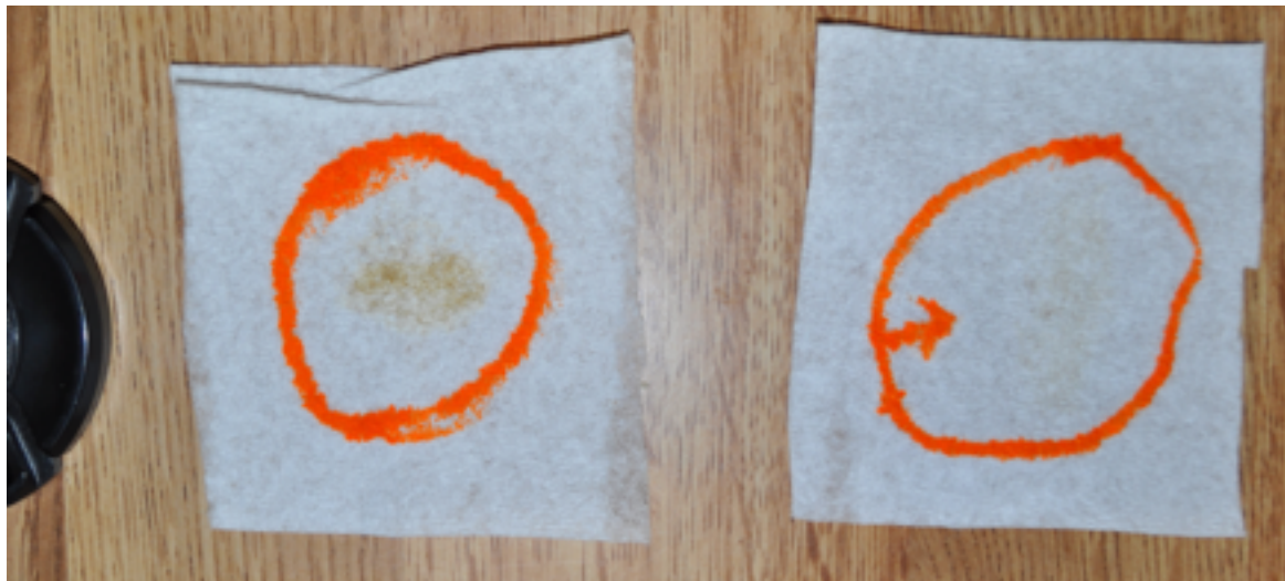
Figure 0. Lens Cap for scale. Before Structuring (left). After Structuring (right).

This whole process started when we initially took a cigarillo (thin cigar) and smoked it through a NAT Portable Unit. The puff test on a white napkin before and after spoke for itself (see Figure 0). The cigarillo "before structuring" stained the napkin brown. However, "After structuring", there was no such stain. The napkin was now essentially white. Yes, one can structure a cigarette or a cigar!