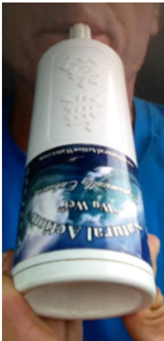
Figure 1a. Structured Breathing With NAT Portable Unit (Beta or Alpha Brain Wave Access)

With the Natural Action Technologies Structuring Unit at one's lips, breathe in through the structuring unit of choice, inhaling directly into the mouth deeply and smoothly. (See Figure 1a and 1b.) Do not force the inhale, but do go as deeply as your breathing allows. Exhale out the mouth, but do NOT exhale back into the unit.