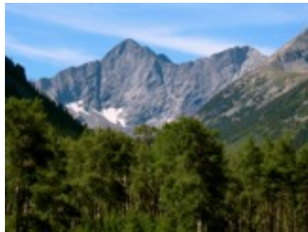
Figure 7 & 8. Structured Energy Halo during use through the forbidden heights: real clouds or compromised air?

A climbing friend once said, “We cannot lower the mountain, therefore we must elevate ourselves.”