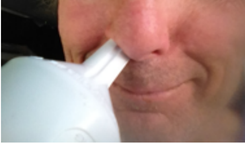
Figure 3a. Structured Breathing With NAT Portable Unit (For Theta or Delta Waves)