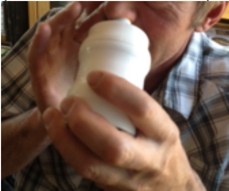
Figure 3c. Structured Breathing With NAT Mini Shower Unit (For Theta or Delta Waves)