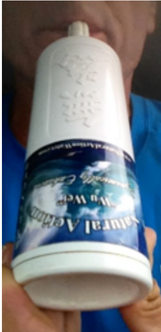
Figure 2a. Structured Breathing With NAT Portable Unit (Beta or Alpha Brain Wave Access)

Connect thumb and middle fingertips on both hands in an O-ring fashion. With the Natural Action Technologies Structuring Unit at one's lips, breathe in through the structuring unit of choice, inhaling directly into the mouth. Again do not force the inhale, but do inhale as long and deeply as comfortably possible. (See Figure 2a and 2b.) Exhale out the nose. Do NOT exhale back through the unit.