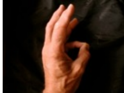
Figure 4b. Delta Finger Pattern (Thumb-Pinkie Fingertips Contact)