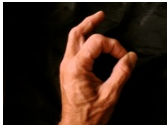
Figure 1b. Beta Finger Pattern (Thumb-Index Fingertips Contact)