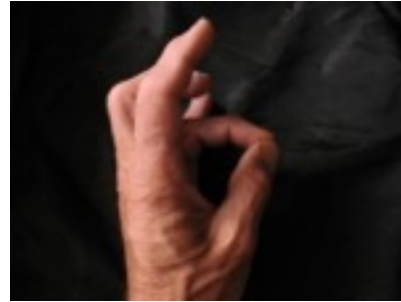
Figure 3b. Theta Finger Pattern (Thumb-Ring Fingertips Contact)